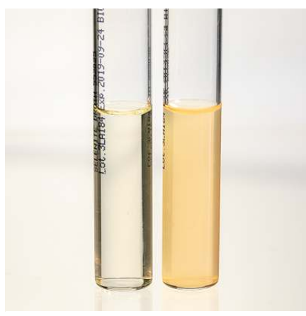
Selenite Broth - from the left: un-inoculated tube and S.Typhimurium growth