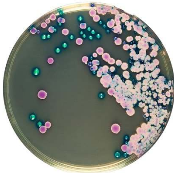
Chromogenic Candida Agar: C. albicans (green-blue colonies), C. tropicalis (blue-gray colonies) and C. krusei (large pink-violet colonies)