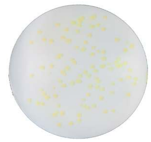
Pseudomonas CN Selective Agar: colonies of P. aeruginosa on a membrane filter

Dehydrated culture medium, selective supplements, ready-to use plates